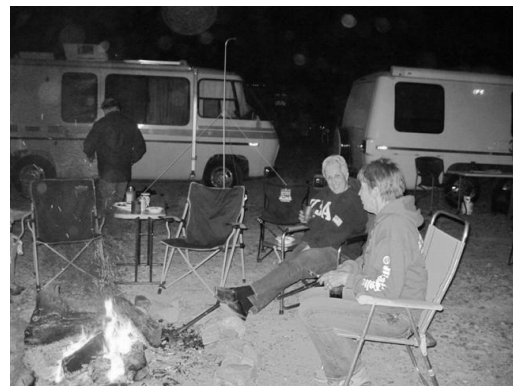
By the bonfire

The meeting was adjourned until our next GMC 49'er Rally on March 12-14.