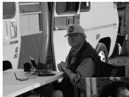
On the net